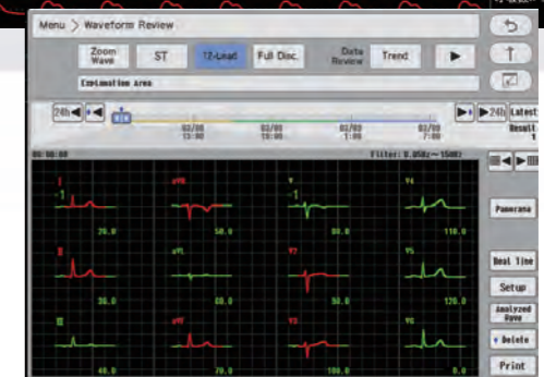
▲ Dominant waveform display