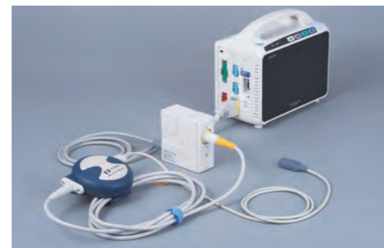
▲ BISx I/F unit : HBX-800

Compatible with the BISx module to monitor and display the depth of anaesthesia index.