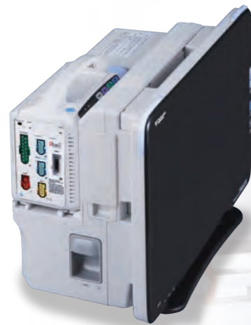
▲ with DS-8007M image

※N = Nellcor type pulse oximeter unit M = Masimo type pulse oximeter unit