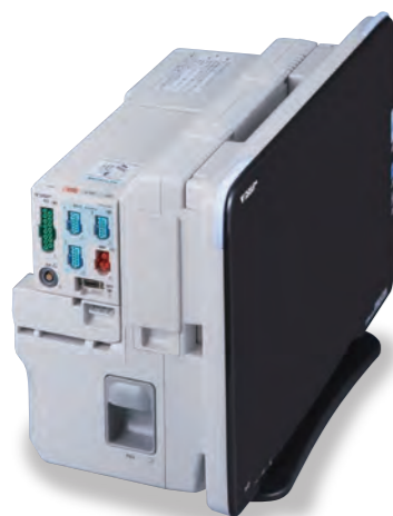
▲ with HS-8312N image

Never miss a beat, with continuous monitoring using the transport module or minimonitor(DS-8007) for a flexible and seamless workflow throughout the hospital.