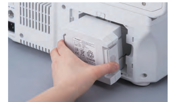
▲ Integrated battery pack BTO-005

The built-in battery enables 90 minutes of continuous operation.