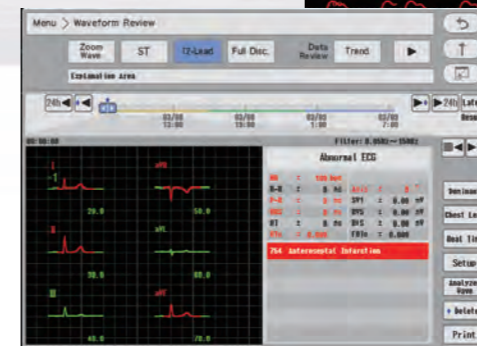
▲ Display analysis result