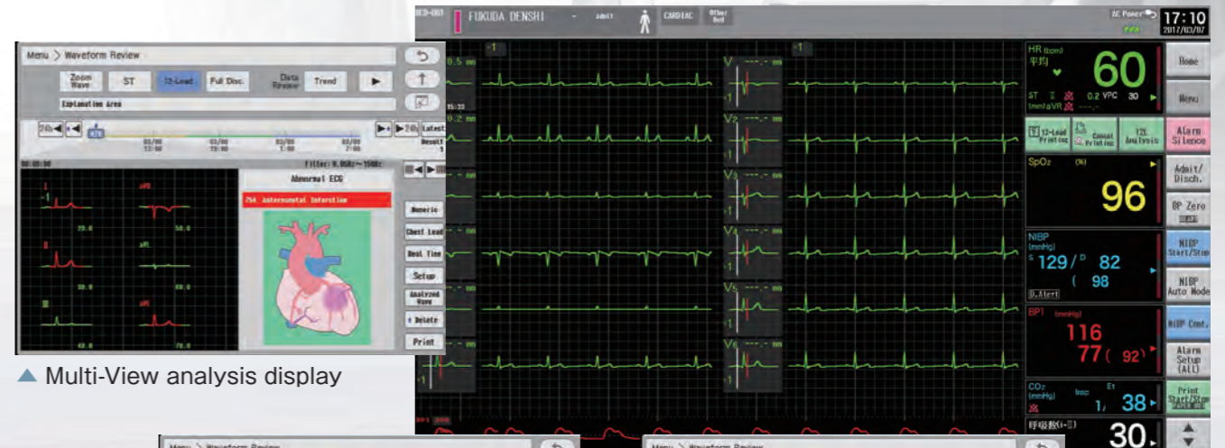
▲ Multi-View analysis display

12 lead ECG monitoring is possible. Superior 12 lead ECG analysis allows easy patient diagnosis. Results can be instantly displayed.